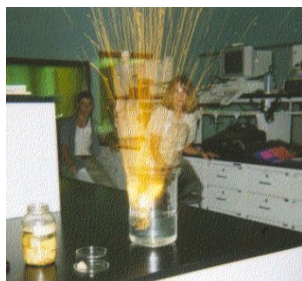
Alkali metal reaction with water

vigorous going down the group: lithium reacts steadily with effervescence, but sodium and potassium can ignite and rubidium and cesium sink in water and generate hydrogen gas so rapidly that shock waves form in the water that may shatter glass containers. When an alkali metal is dropped into water, it produces an explosion, of which there are two separate stages. The metal reacts with the water first, breaking the hydrogen bonds in the water and producing hydrogen gas; this takes place faster for the more reactive heavier alkali metals. Second, the heat generated by the first part of the reaction often ignites the hydrogen gas, causing it to burn explosively into the surrounding air. This secondary hydrogen gas explosion produces the visible flame above the water, not the initial reaction of the metal with water (which tends to happen mostly under water).